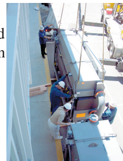
Exciting things are happening: Workers deliver a new chiller system at Harbor College.