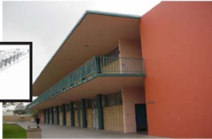
Color Theme before exterior painting

The planning for new facilities and equipment has brought attention to the issue of future key access on campus. The implementation of modern card key access in new buildings will provide greater security, flexibility and efficiency, and the newly installed fire alarm system can support the card key access in the existing buildings