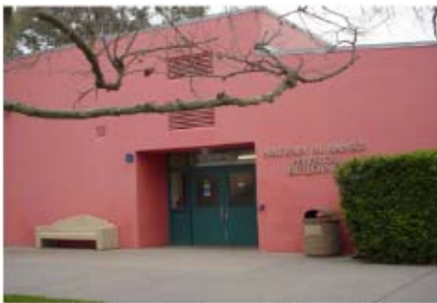
Color Theme before exterior painting

The Plant Facilities operations will be moved from the center of campus to the northwest corner and will house Maintenance and Receiving. Construction should begin June 2004 and last 8 months.