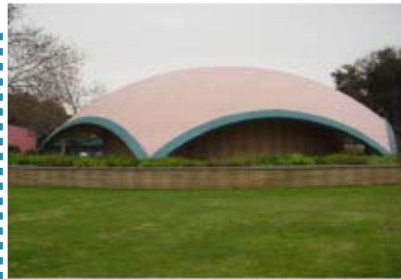
Color Theme before exterior painting

Since the passage of Prop A, 60 contracts for the design and implementation of construction, renovation and repair have been approved by the District Board of Trustees.