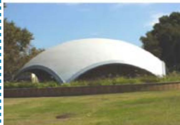
Color Theme after exterior painting