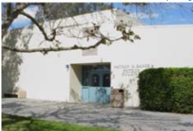
Color Theme after exterior painting