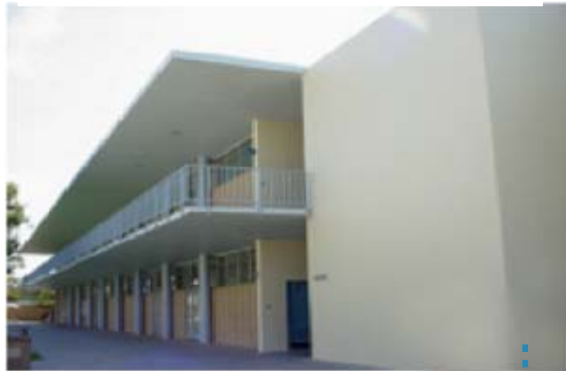
Color Theme after exterior painting